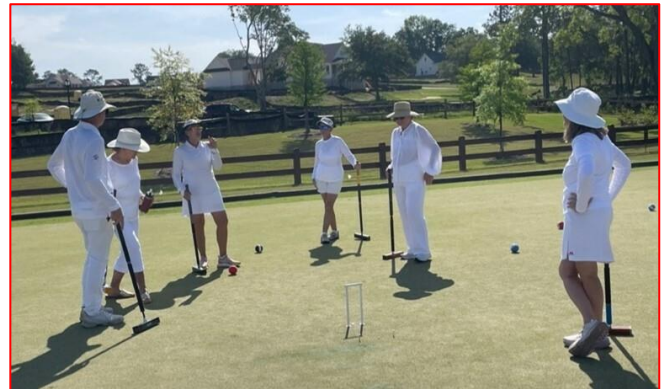
Morning clinic session and pro-am match