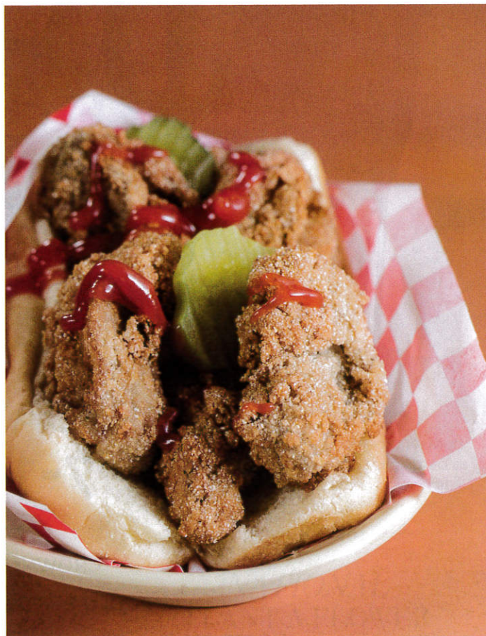
OYSTER LOAF FROM THE DEW DROP INN.

ZOËS KITCHEN • 3980 AIRPORT BLVD., SUITE A 344-9445 • ZOESKITCHEN.COM